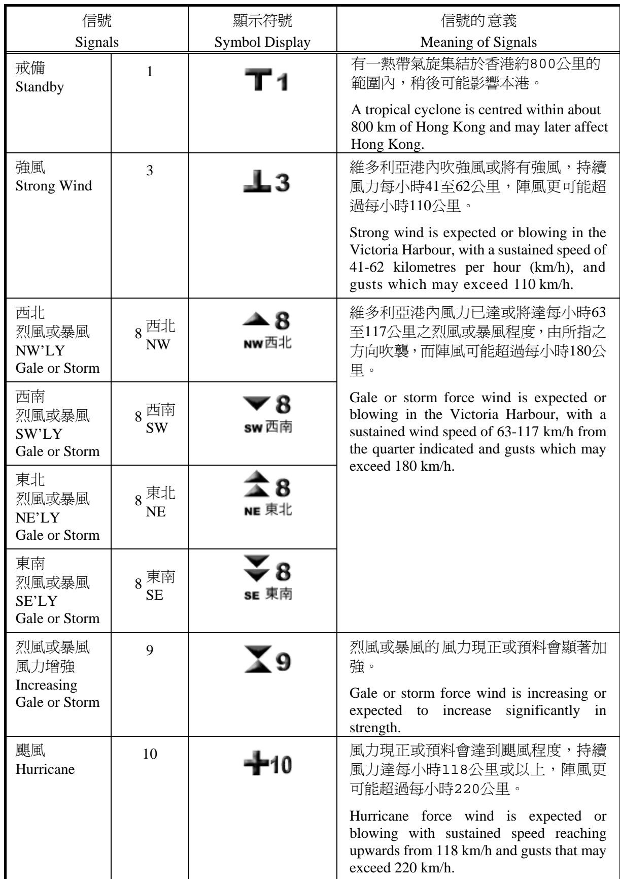
TABLE 2.3 MEANING OF TROPICAL CYCLONE WARNING SIGNALS IN HONG KONG IN 2006